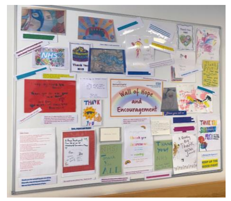
Wall of Hope and Encouragement

After receiving hundreds of cards, drawings, letters and well wishes, HHCC have created a Wall of Hope and Encouragement - located by the chapel at HDFT. The wall aims to inspire positivity to our colleagues and thank them for their hard work and dedication.